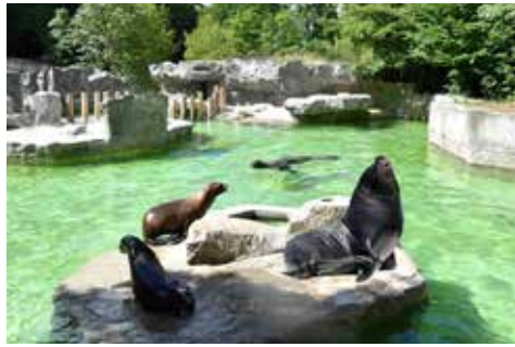
ZOO HELLABRUNN MUNICH, GERMANY