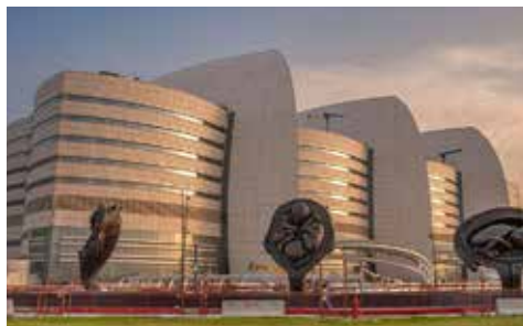
SIDAR MEDICAL AND RESEARCH CENTER DOHA, QATAR