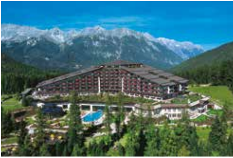
INTERALPEN-HOTEL TIROL, AUSTRIA