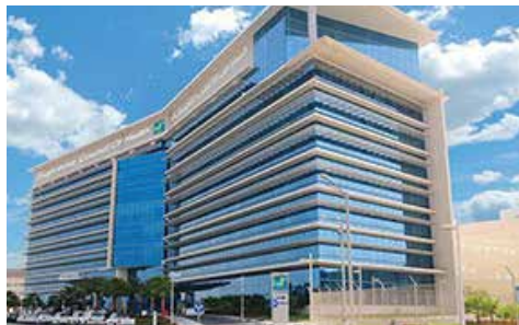
MINISTRY OF PUBLIC HEALTH DOHA, QATAR