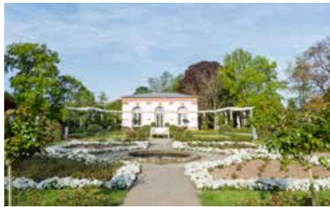
PALM GARDEN FRANKFURT, GERMANY