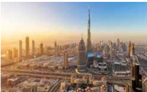
BURJ KHALIFA DUBAI