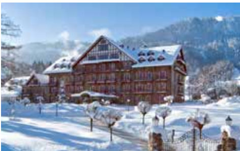
GRAND HOTEL, KITZBÜHEL, AUSTRIA