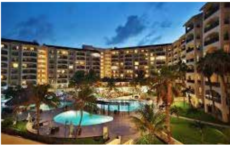
RESORT ROYAL ISLANDER CANCUN, MEXICO